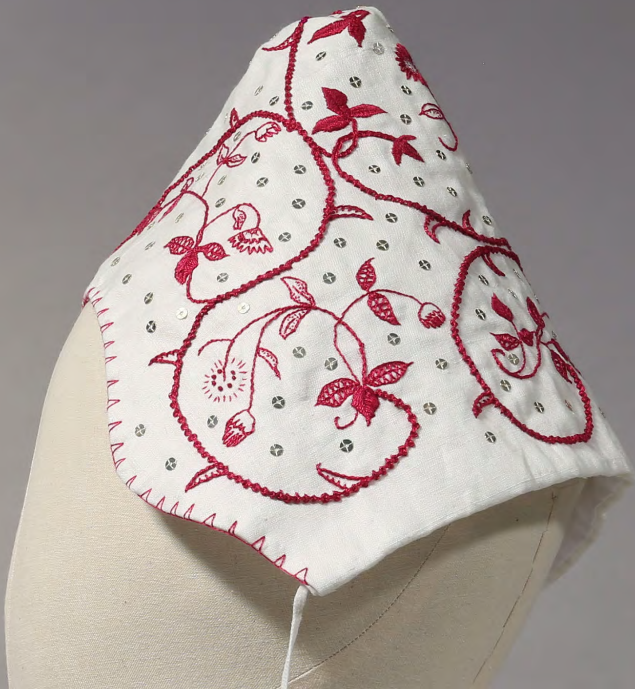
Ann Stainton, Child's coif. Silk thread and silver spangles on a handwoven linen ground, 2019