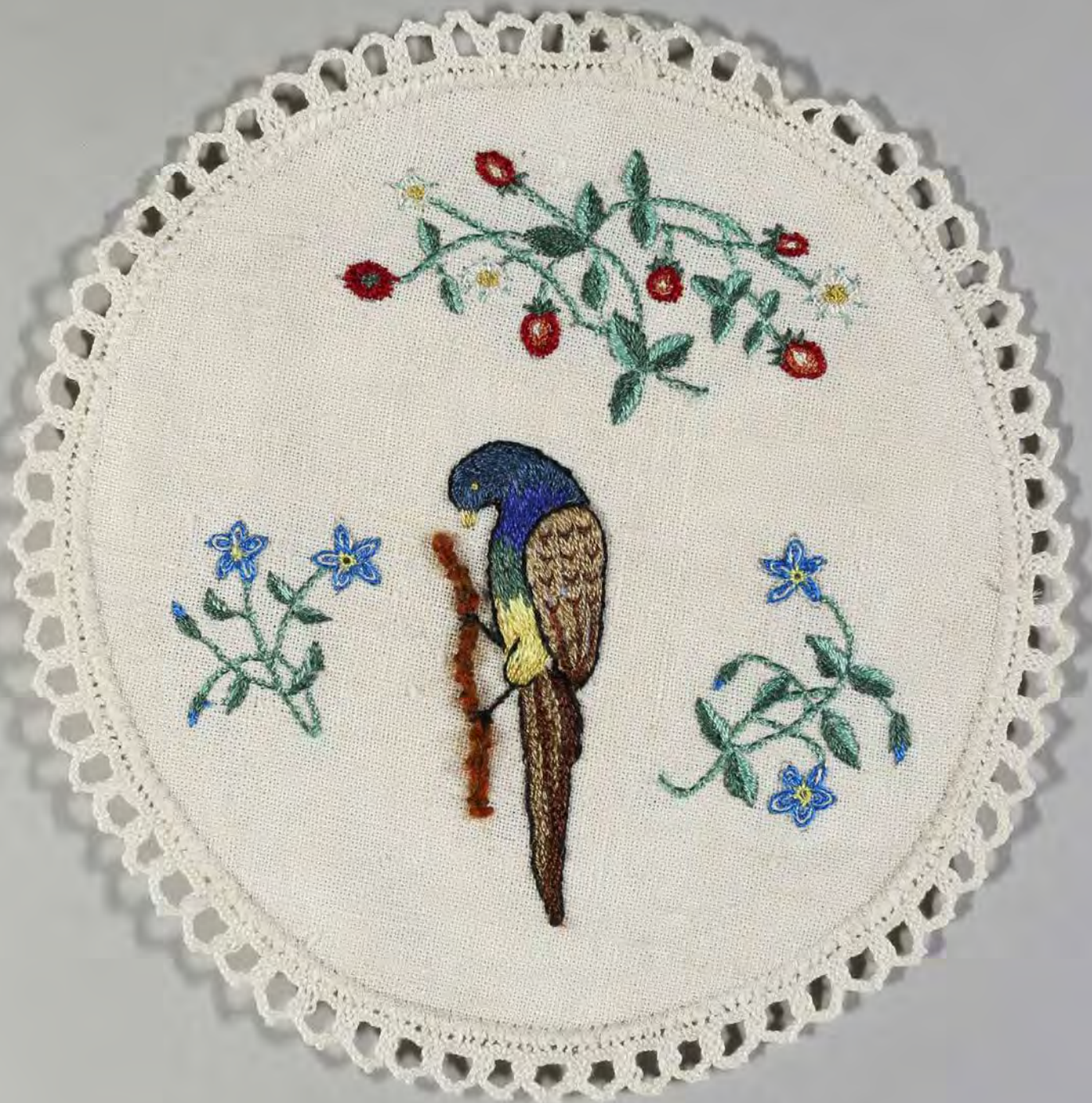
Andrea Green, Table mat. Silk and wool threads on a linen ground, 2019