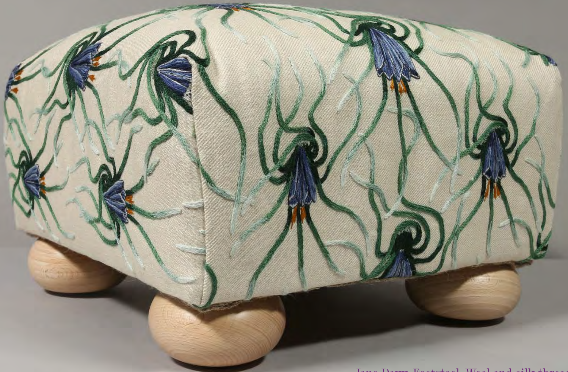
Jane Davy, Footstool. Wool and silk threads on a linen ground, 2021