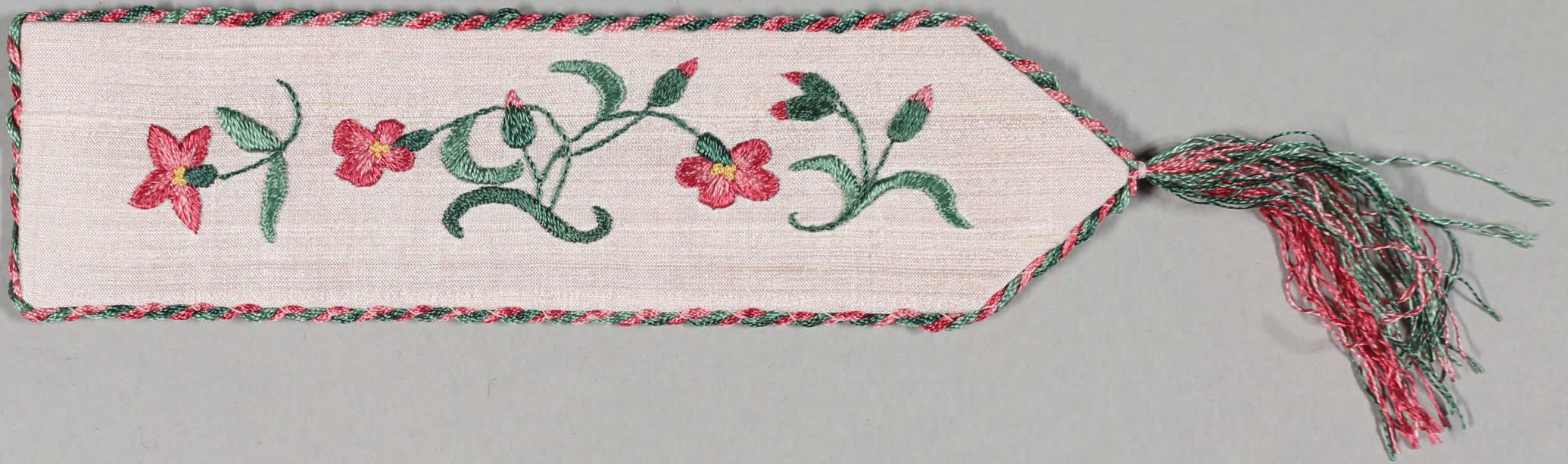
Chris Hillman, Bookmark. Silk threads on a silk dupion ground, 2020