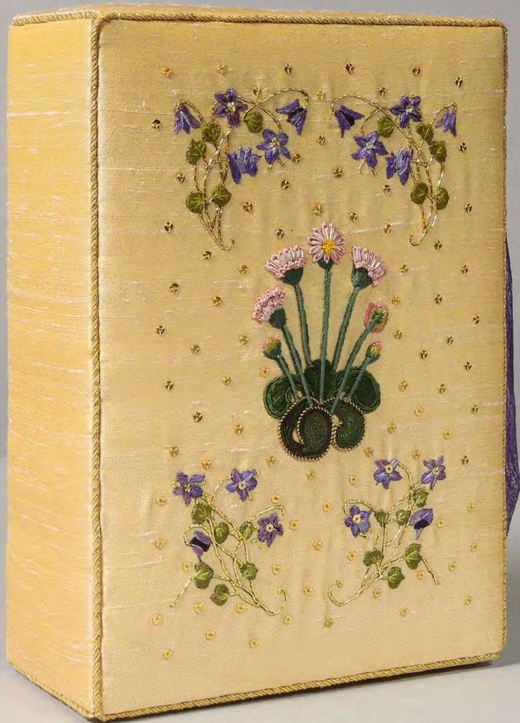
Jane Bawn, Slip case for a Bible. Silk and metal threads with gilt spangles on a silk ground, 2020