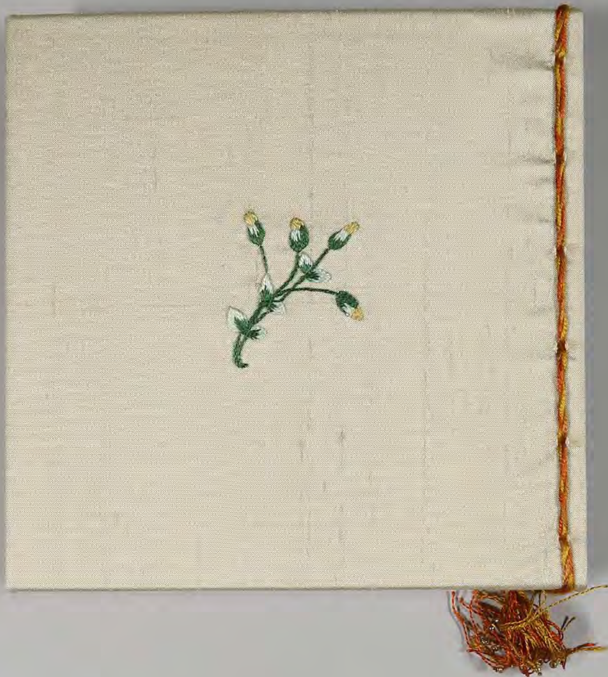
Chris Hillman, Book cover. Silk and metal threads on a silk dupion ground, 2020