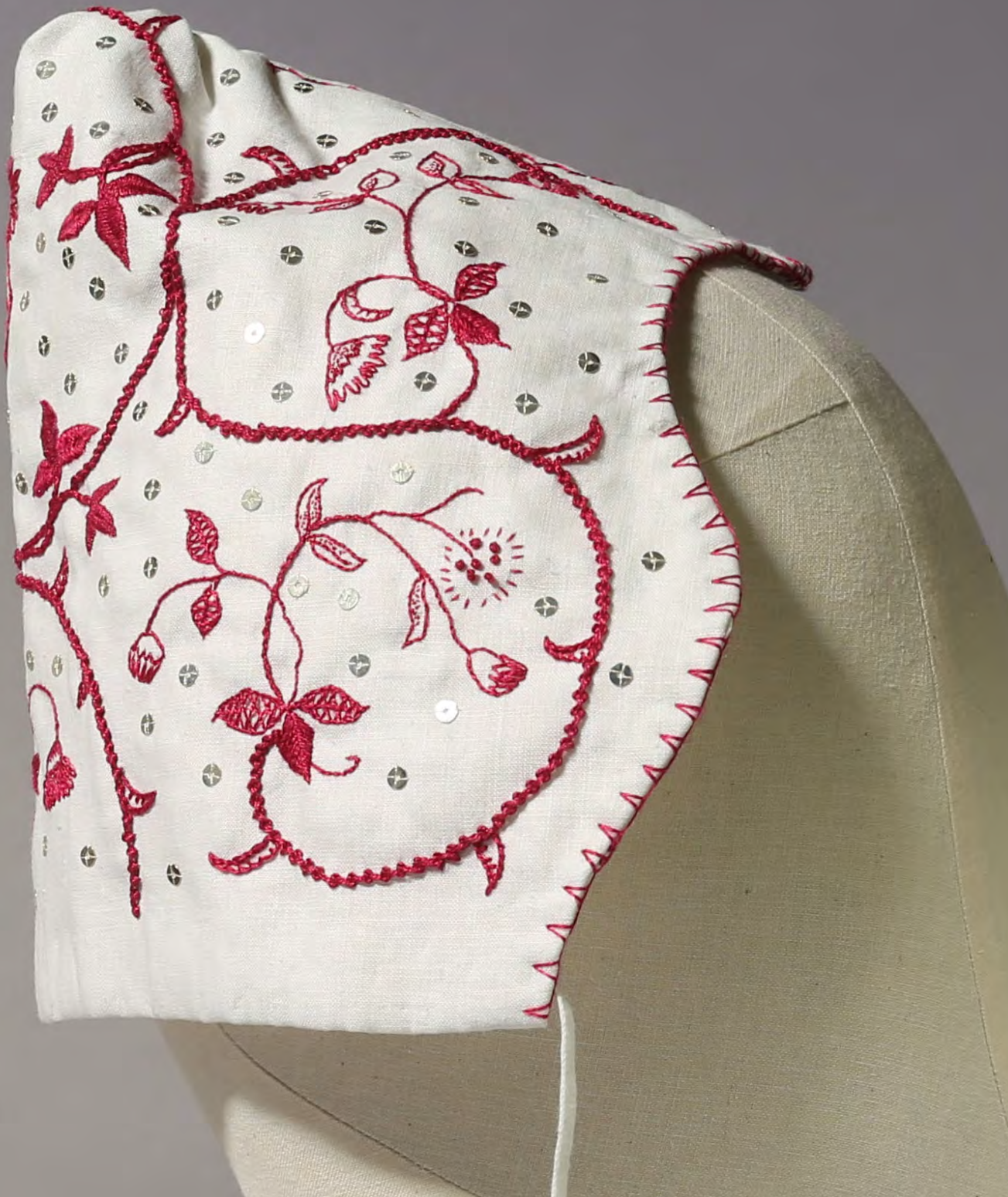
Ann Stainton, Child's coif. Silk thread and silver spangles on a handwoven linen ground, 2019