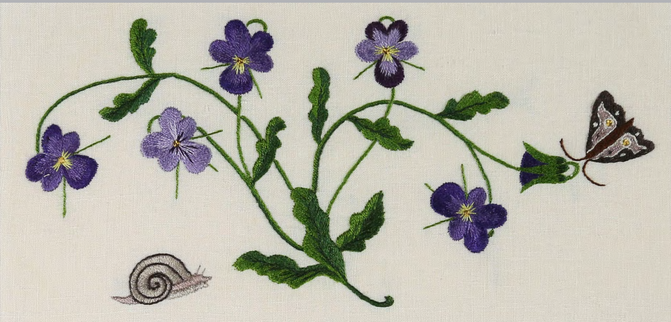
Janet Evans, Picture panel. Silk with gilt spangles on a linen ground, 2020