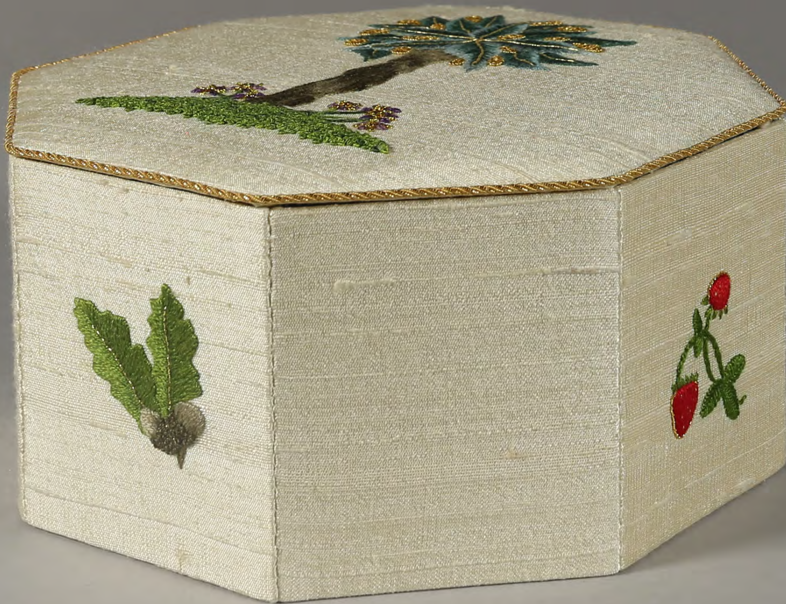
Rita Masters, Octagonal box. Silk and metal threads with spangles on a silk dupion ground, 2020