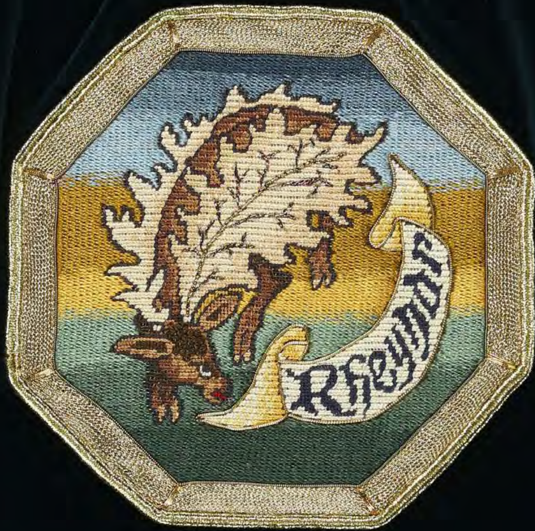
Janet Every, Reindeer. Slip worked in silk and metal threads on linen, applied to a velvet ground, 2020