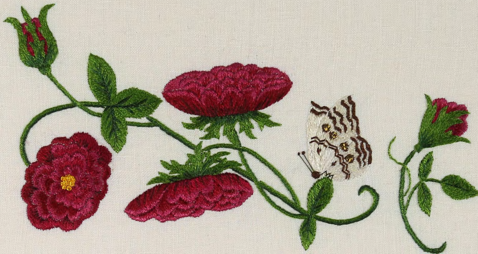
Janet Evans, Picture panel. Silk with gilt spangles on a linen ground, 2020