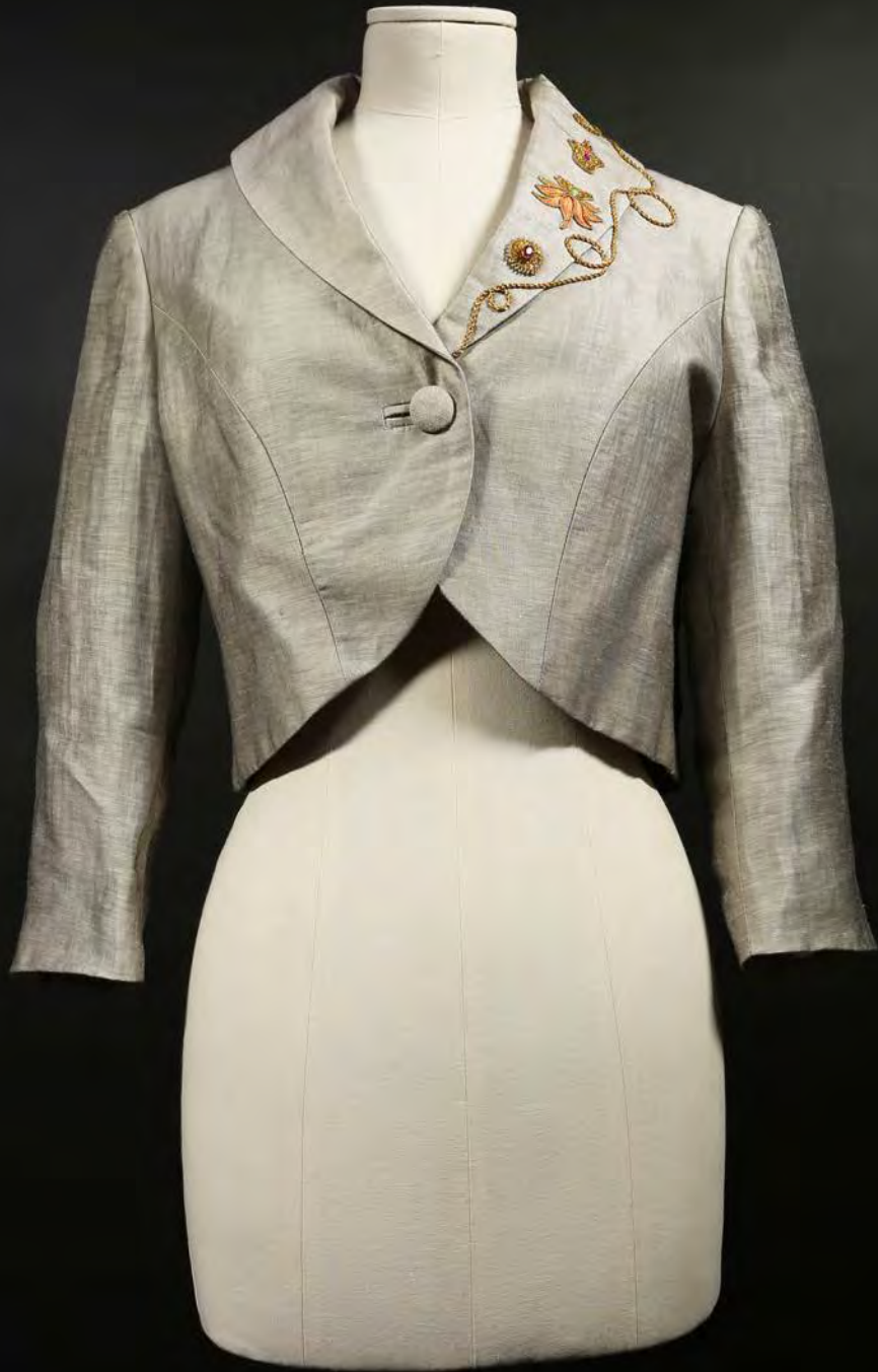
Ann Howden, Jacket. Silk and metal threads with silk appliqué and beads on a silk ground, 2020