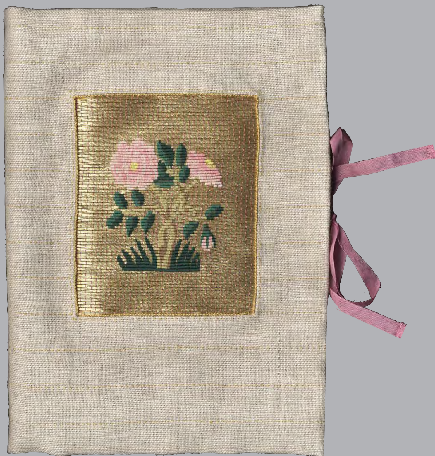
Sally Giffen, Hussif or pocket sewing kit. Silk and metal threads on a linen ground, 2020