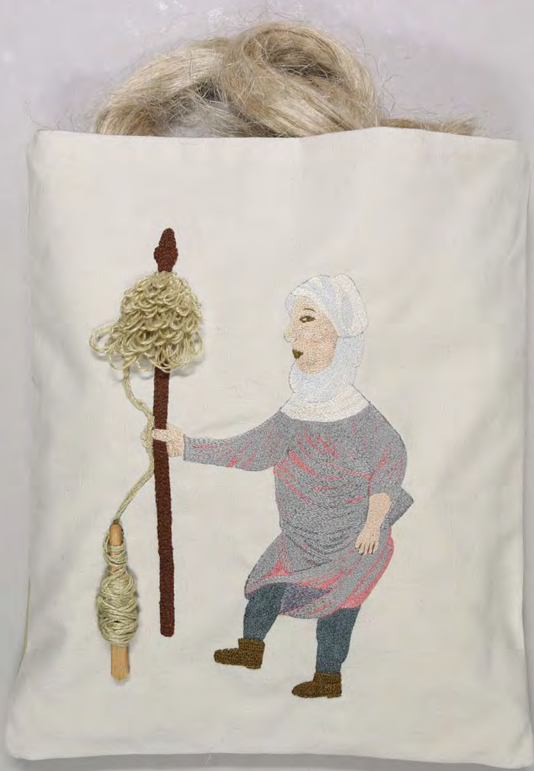
Gwyn Higginson, Flax spinner with distaff and spindle. Silk and linen threads on a linen ground, 2019