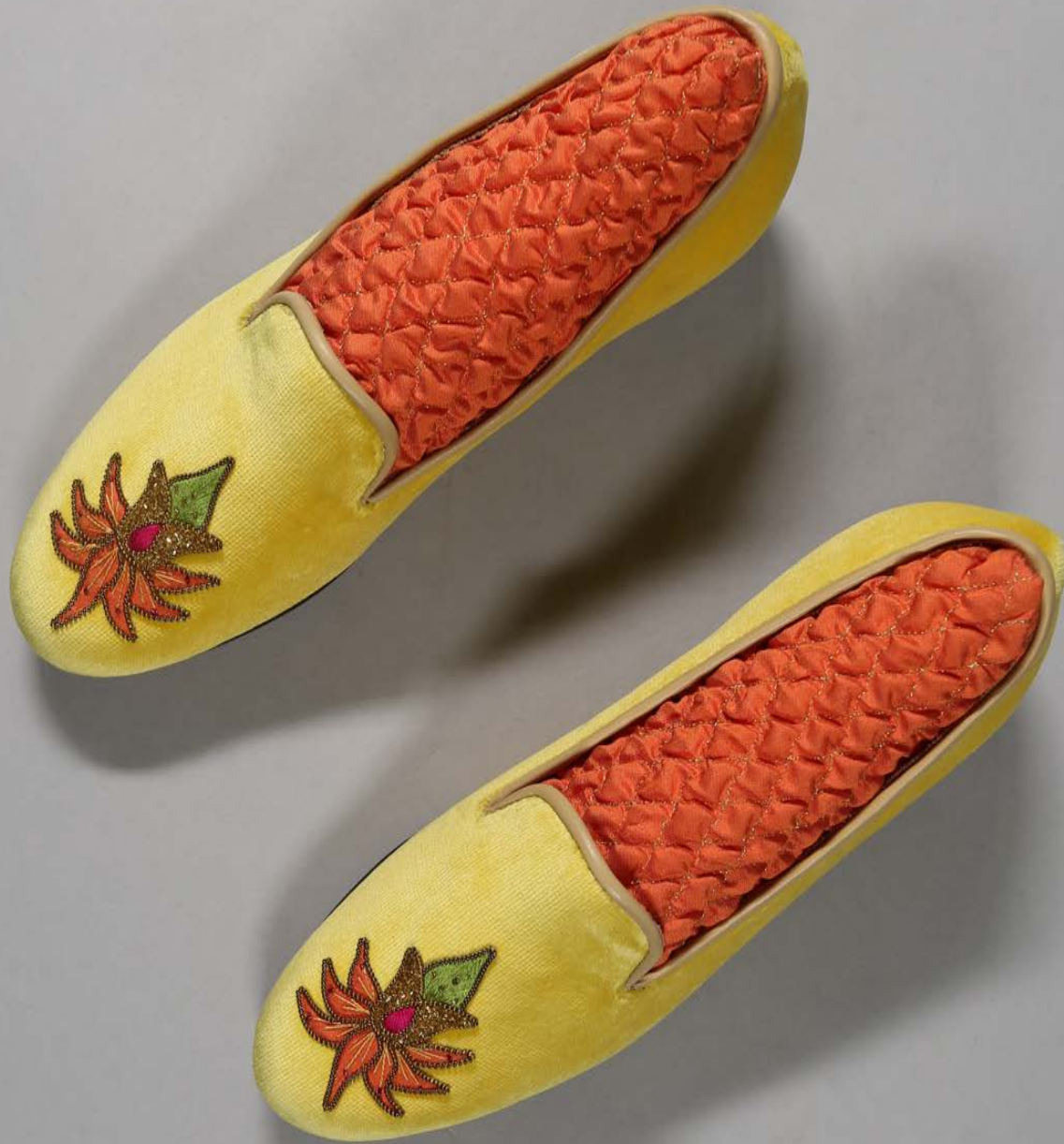
Anne Howden, Slippers. Silk and metal threads with silk appliqué and beads on a velvet ground, 2020