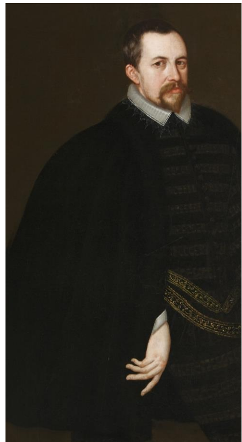
Figure 1 Sir Thomas Bodley (1545-1613)

Overview: Four hundred and twenty years ago, in 1604, in the year of the dragon, the founder of the Bodleian Library in Oxford, Sir Thomas Bodley acquired his first Chinese book for his Library, laying the foundation for the Chinese collections in Oxford. Sir Thomas acknowledged the donor who made his acquisition possible by writing the donor's name and the date on the end paper of the book, but without knowing that he was holding the Chinese book in wrong order and upside down. The book was a partial copy of the popular Confucian essentials, known as ' Four Books ' (四書). By the time of his death in 1613, Sir Thomas acquired 49 volumes of Chinese books, which was likely to be the largest such collection in Europe at the time. In fact, a quarter of all Chinese books arrived in Europe in the 17th century are currently held in the Bodleian Library. Today, Bodleian Libraries holds one of the finest and most important Chinese rare book and manuscript collections in Europe and the largest Chinese collection in the UK.